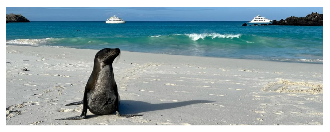
Highlights: Coral sand beach, sea lions, Galapagos hawks, Española mockingbirds, Darwin finches, marine iguanas.

Snorkel: There are several great snorkeling places at Gardner bay. It is a fantastic site to swim with sea lions, reef sharks, rays and many species of fish, including; Angelfish, Parrotfish, Damselfish, Surgeonfish and many others.