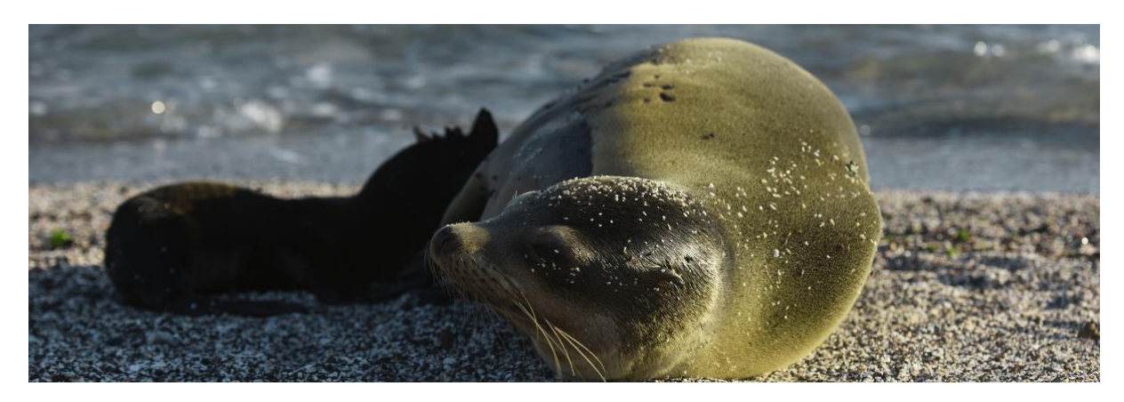
Highlights: Galapagos sea lions, marine Iguanas, magnificent & great frigatebirds, blue-footed Boobies, San Cristobal Lava Lizards.