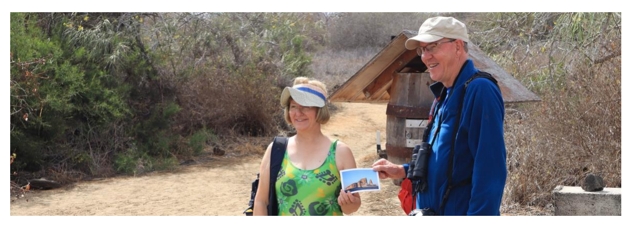
Highlights: Sea Lions, sea turtles, finches, shorebirds, marine iguanas, penguins.

Snorkel: There is great snorkel from the beach, as you can see lots of sea turtles, rays, great diversity of fish and, if you are really lucky, Galapagos penguin