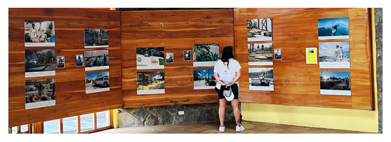
Highlights: Endemic plants, exhibition on human history