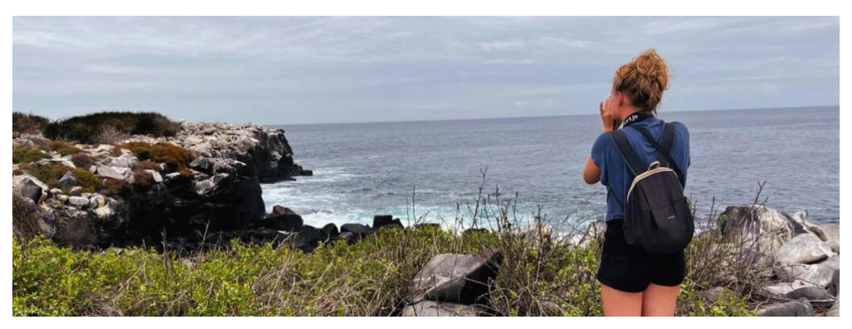
Highlights: Sea lions, Waved Albatross, Galapagos hawks, Española mockingbirds, Darwin finches, marine iguanas, Nazca & Blue-footed Boobies, Red-billed Tropicbirds, Swallow-tailed gulls, herons, lava lizards, herons.

From the moment you set foot on the island and all the way along the trail the amount and diversity of fauna is truly amazing. Sea lions and marine iguanas will be the first ones welcoming us, followed by large colonies of sea birds, including Nazca and Blue-footed boobies, gulls and tropicbirds. At the end of the trail we will visit a colony of waved albatross (April to January), the largest bird in the islands and one of the most interesting because of its powerful flight and elaborate courtship. Waved albatross only nest at Española, so this is the only place where you will see them at close range.