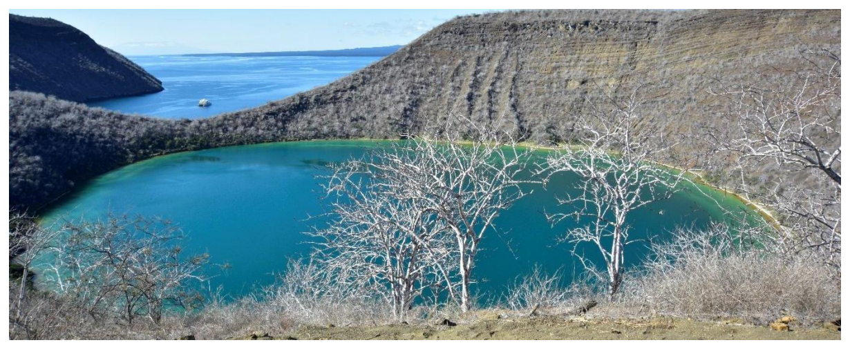
Highlights: Galapagos hawks, marine iguanas, flightless cormorants, herons, penguins, sea turtles, sea stars.