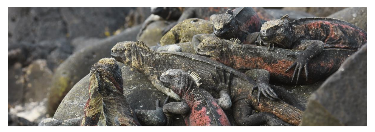
Highlights: Galapagos sea lions, Galapagos fur seals, oystercatchers, marine & land iguanas, Galapagos hawks, herons, shorebirds, Darwin finches, Galapagos doves.

Snorkel: You can snorkel from the beach and explore an area of rocky bottoms which is excellent for fish, turtles and reef sharks. Often, sea lions are also present and are happy to interact with divers.