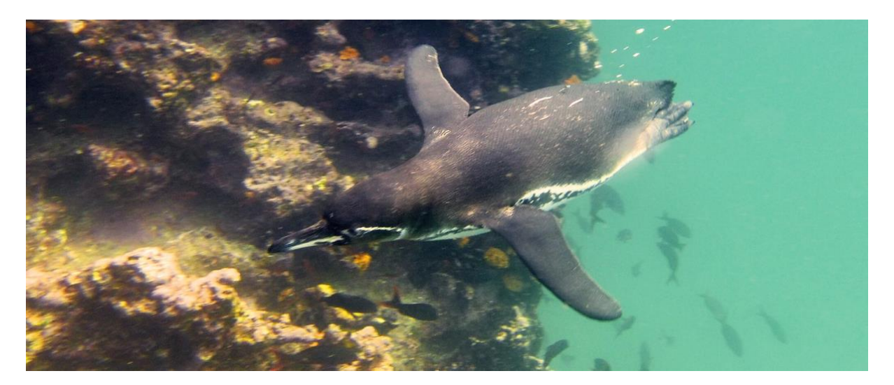
Highlights: Galapagos hawks, land iguanas, Galapagos hawks, Galapagos mockingbirds, Darwin finches, flycatchers.