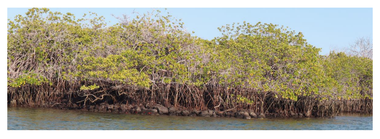
Highlights: Galapagos hawks, sea turtles, rays, Galapagos penguins, flightless cormorants, herons.